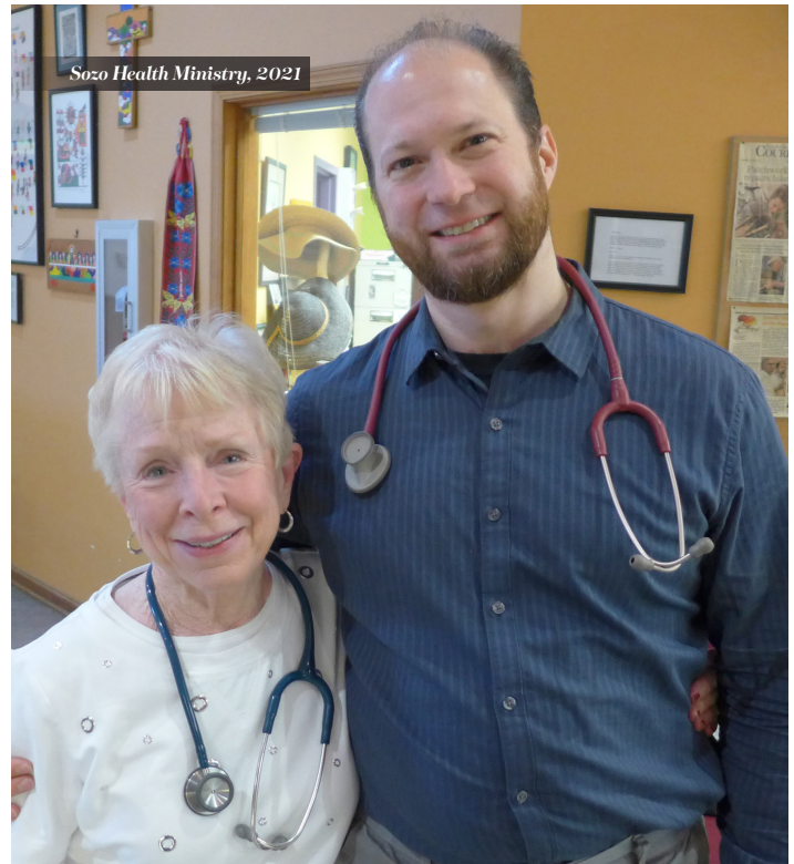
Sozo Health Ministry, 2021