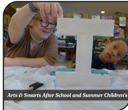
Arts & Smarts After School and Summer Children's Programming

In the last year, 39 children and youth in grades K-8 attended at least one day of Arts & Smarts activities. A total of 123 days of activities were offered in that time, resulting in 898 individual afternoons of creativity, learning, and growth. Of those children, 79% belonged to low-income families. All of our programming was offered at no cost to the children’s families. Daily activities included one-on-one homework help, visual arts, gardening, leadership training, and substance abuse prevention. Through these activities, children gained important skills for life. Our program evaluation indicated that they built relationships within a supportive community of adults and fellow participants who encouraged them to explore their interests and to do better, which are indicators of future success. ♦