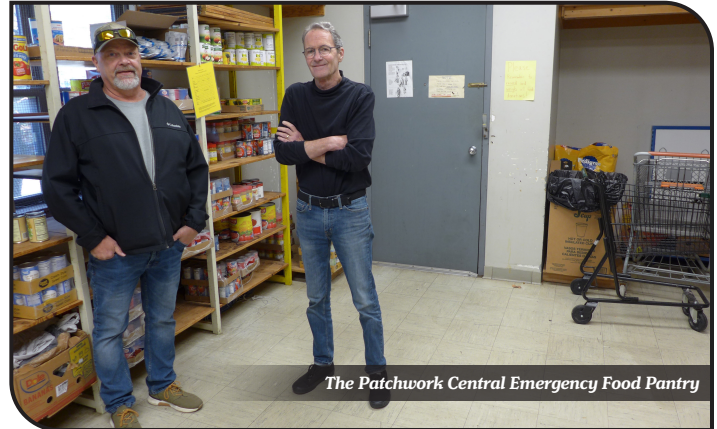
The Patchwork Central Emergency Food Pantry

Last year, our food pantry served 1971 individuals from 1186 households by distributing over 19 tons of food. The Pantry is open Monday–Thursday mornings and is one of six that make up Evansville’s Emergency Food Pantry Consortium (EEFPC). Individuals are eligible for a food order every 30 days. Our main office staff manage intake and verify eligibility through the EEFPC call center. They also refer people to other pantries if needed. Each food order includes 3-4 days’ worth of food, meaning we distributed approximately 23,600 meals-worth of food. Our food pantry also distributed 1522 pounds of dog food and 920 pounds of cat food from the Tuly Fund so recipients would not have to choose between feeding themselves or their pets. ♦