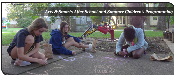
Arts & Smarts After School and Summer Children's Programming

One service Patchwork provides to our neighbors is simply our presence in the neighborhood. We call it Neighborhood Hospitality. Last year, we logged approximately 11,905 instances of hospitality. These included cups of coffee, phone use, bread, fresh vegetables, and referrals to other local agencies better equipped to assist the individual with their needs. It also included showers for 594 women and 1556 men (2150 total) who, for various reasons, had no other access to shower facilities. They also included over 1600 instances of hygiene supplies distributed, over 1300 pairs of socks distributed, and over 400 referrals to other agencies better equipped to assist with a specific need. We also brewed approximately 1712 pots of coffee and mixed up 346 pitchers of lemonade. Sometimes this hospitality is simply having a staff member able to lend a respectful listening ear to hear our neighbors’ frustrations, anger, or celebrations. ♦